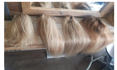
Some of the wigs renovated by the staff and pupils at the salon