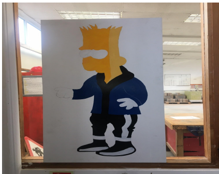
Henry's super sign