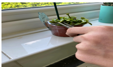
Henry is feeding a venus flytrap