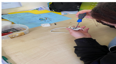
Elisa is a dabhand wiring a plug