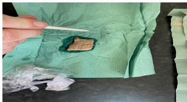
Destini looked at the effects on liver that was subject to 3 days worth of alcohol