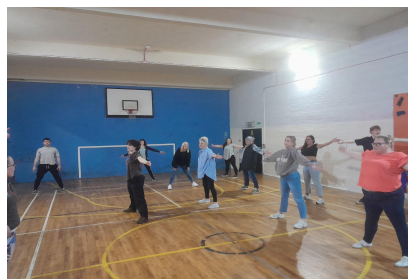
A group of staff preparing for their seizure training

Broadstones promotes physical and mental wellbeing for all staff and pupils - with INSET often comprising an element of this.